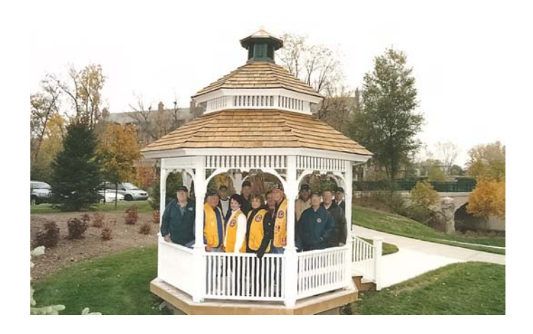
There's room for more in here!