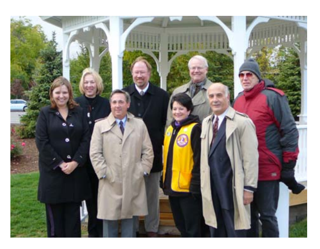
Dignitaries at Rochester Lions Park Dedication Ceremony