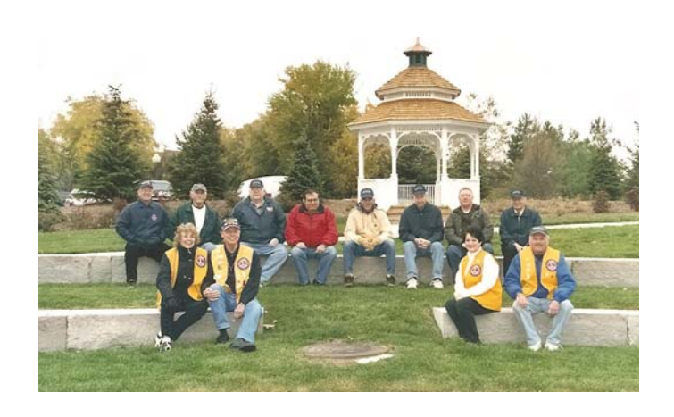
So many photos. . .we feel like models!

The Park Dedication Ceremony was held on October 12<sup>th</sup> and the member's photo shoot was October 21<sup>st</sup>. Thanks to everyone who showed up for both dates!